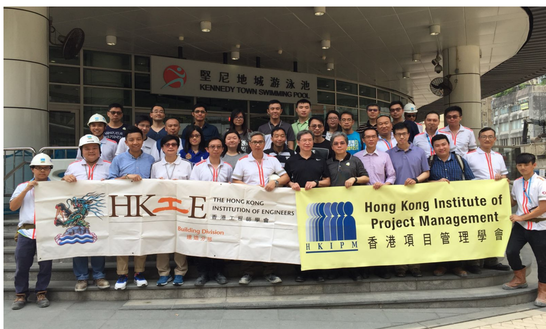
Group photo of the participants with the representatives from the main contractor after the guided site visit