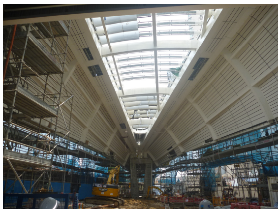
Construction of curved steel roof clad in progress