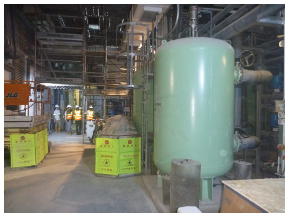
Plant rooms of facilities under construction