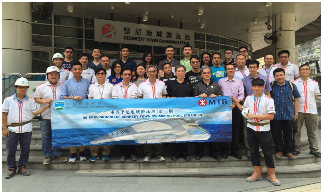
Group photo of the participants with the representatives from the main contractor after the guided site visit