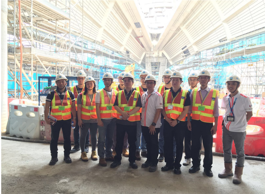
Group photo of the HKIPM members with the representatives from the main contractor during the guided site visit