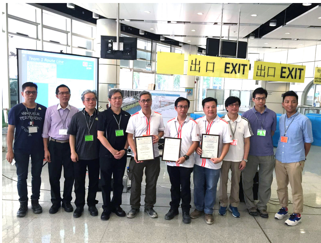
Group photo of some HKIPM council members and HKIE (BUD) committee members with the representatives from the main contractor at the entrance foyer of Phase 1