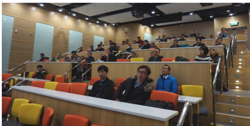
Full house participation by industrial practitioners