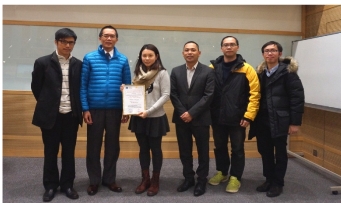
Group photo of some council members of HKIPM and members of CPD and Training Committee of HKICM with the guest speaker