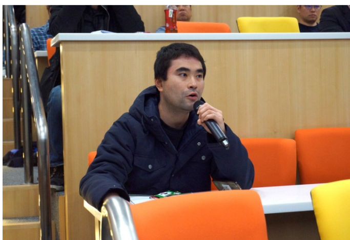
Questions from the audience during the Q&A session after the seminar