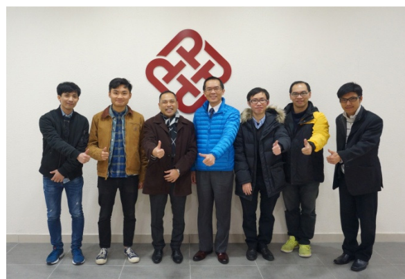
Group photo of some council members of HKIPM and members of CPD and Training Committee of HKICM with student helpers