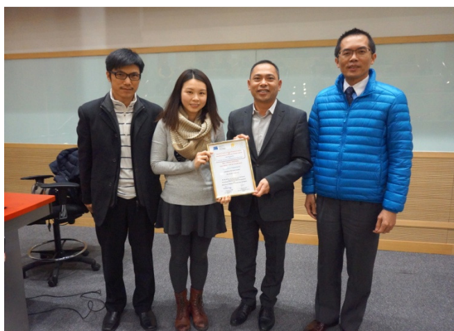
Presentation of certificate of appreciation to the guest speaker after the seminar